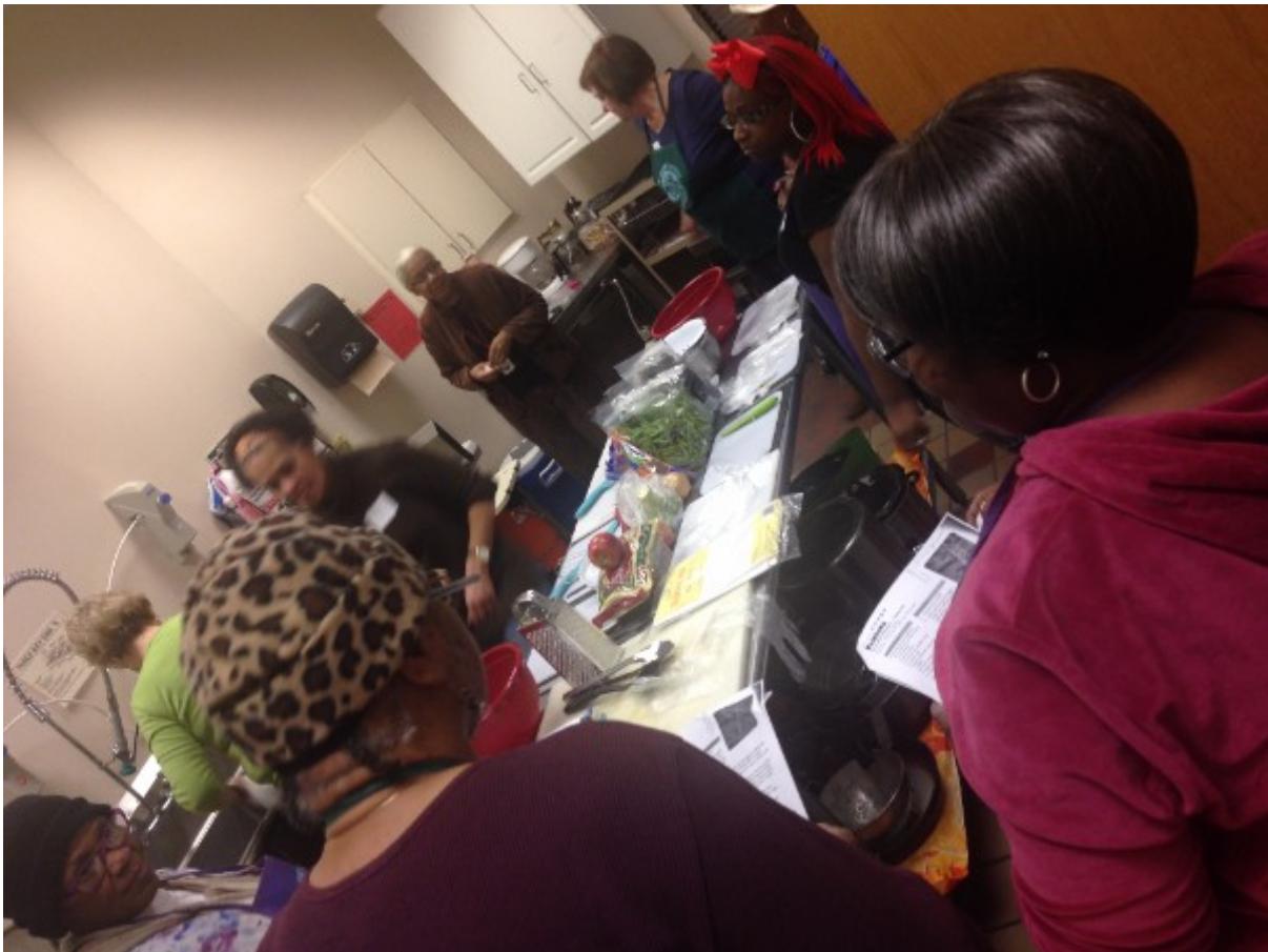
The Cooking Matters Class started off last week with great success with participants creating a frittata.